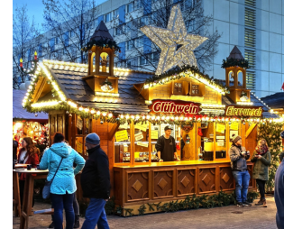
Mulled wine stall at the Leipzig Christmas Market.

Year after year, you have strolled through the Christmas market, catching up with old friends over mulled wine. Lately the prices have been absurd, and just a few evenings leave you in financial ruin. This year, you decided to turn things around and open a stall selling mulled wine. But competition is fierce, and it turns out that yet another absurdly overpriced stall is far less profitable than you hoped.