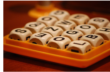
A tray of Boggle dice, out of order.

It is the 25th of February, 2025. You have enjoyed another spirited evening of Boggle with your friends. After everybody left, you have thoroughly cleaned the apartment. All that is left is to bring the Boggle tray in order. You start to wonder: would it be possible to bring the Boggle tray in alphabetic order, without swapping any dice, but only by rotating them?